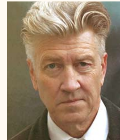
DAVID LYNCH is an award-winning director, writer, and producer, and the chairman of the David Lynch Foundation for Consciousness-Based Education and World Peace.

The David Lynch Foundation was established to ensure that any student in America who wants to learn the TM technique can do so. We are partnering with other foundations and philanthropists to provide scholarship funding that will enable students in schools throughout the nation to learn the TM technique and to receive a lifelong follow-up mentoring program, thereby ensuring that they receive the maximum health-promoting benefits. We also provide funding to support research on the effects of the TM technique on brain, behavior, and health, as well as tuition scholarships for students who want to attend highly successful schools founded on the Consciousness-Based approach to education.